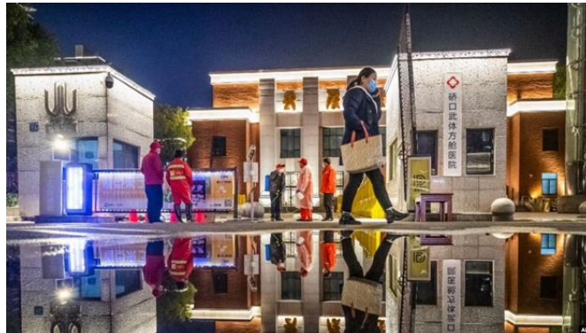
Wuhan city's sports stadium of mobile cabin hospital

It is reported on 02 March 2020 that the last batch of patients infected with the new coronavirus in Wuhan Qiaokou sports stadium of mobile cabin hospital recovered and was discharged. Medical staff was preparing to close this cabin hospital 5 .