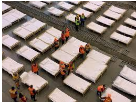
Cabin hospital in Wuhan